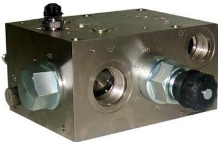
HVD - 2065 Dual Pump - 65 GPM/pump