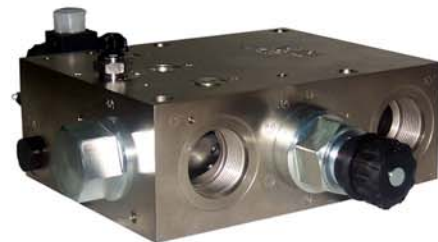
HVD - 1130 Single Pump - 130 GPM/pump

Contact Your Equipment Dealer For Further Details